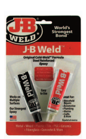
Super Glue (GEL) OR J-B Weld Epoxy