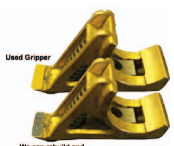
We can rebuild and Diamond Coated your gripper finger with a 60/80 grit